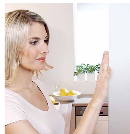
CS 80 MAGNEO with “Low-Energy Mode”: The door will stop and reverse upon light contact.

Visit www.dorma.com for further automatic sliding door solutions in various fields of application.