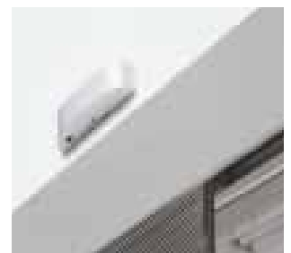
2 For enhanced ease of access: Motion detectors.