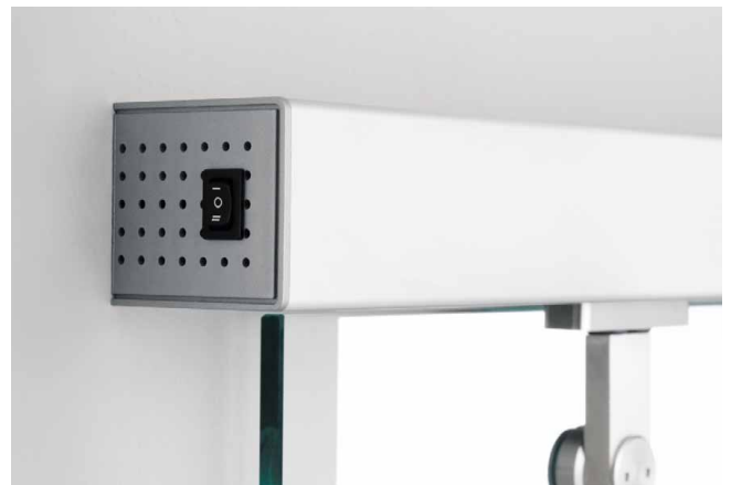
1 CS 80 MAGNEO with locking device in DORMA matt stainless steel design.