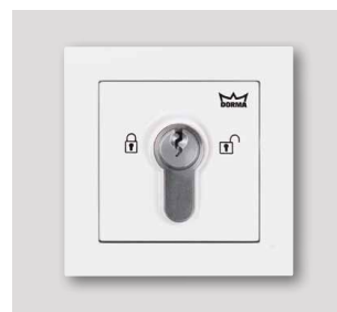
4 Locking function. The CS 80 MAGNEO automatic sliding door operator now provides a locking function with key switch control in order to prevent unauthorized access. Its locking system is concealed behind the cover.