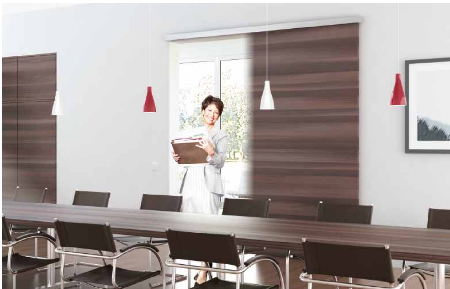
CS 80 MAGNEO automatic sliding door operator – here applied to the timber door of a conference room.

“Whenever we have our hands full, automatic doors make life easier.”